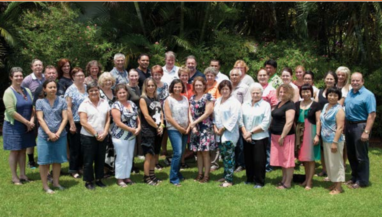
FACULTY OF LAW, EDUCATION, BUSINESS & ARTS / SCHOOL OF EDUCATION